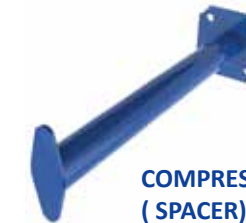
COMPRESSION EQUIPMENT ( SPACER) 25 cm