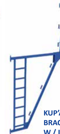
KUP'A ACCESS BRACKET W / LADDER